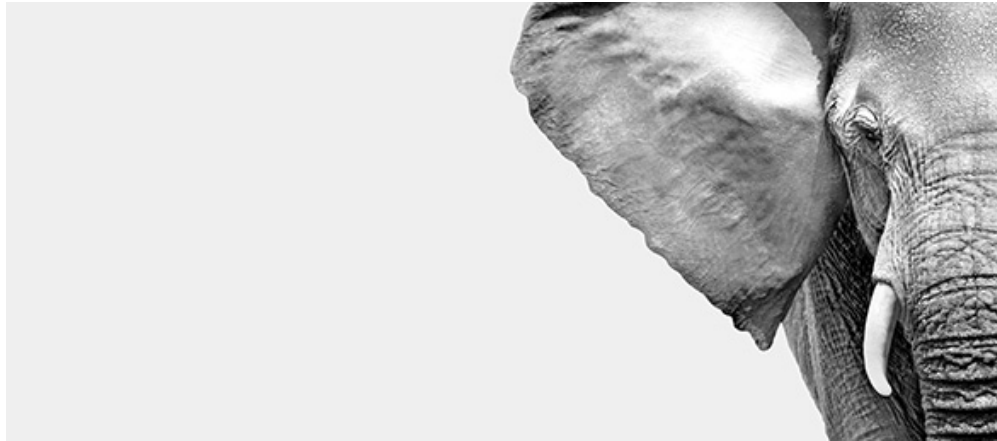
Image not found file:///home/globalpa/private_files/letter%20to%20clients.JPG

Submitted by Victoria on March 23, 2020 - 9:26am